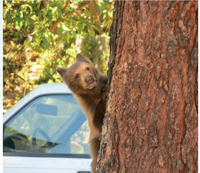
TRTP construction crews regularly encounter a variety of wildlife, such as this black bear cub which was spotted in Duarte last September. Construction crews receive training on how to work safely knowing wildlife are in the areas we are building.

If you have any questions about the scheduled work or other project-related activities in your neighborhood, please contact us at the project hotline at (877) 795-8787 or visit the TRTP website at www.sce.com/trtp .