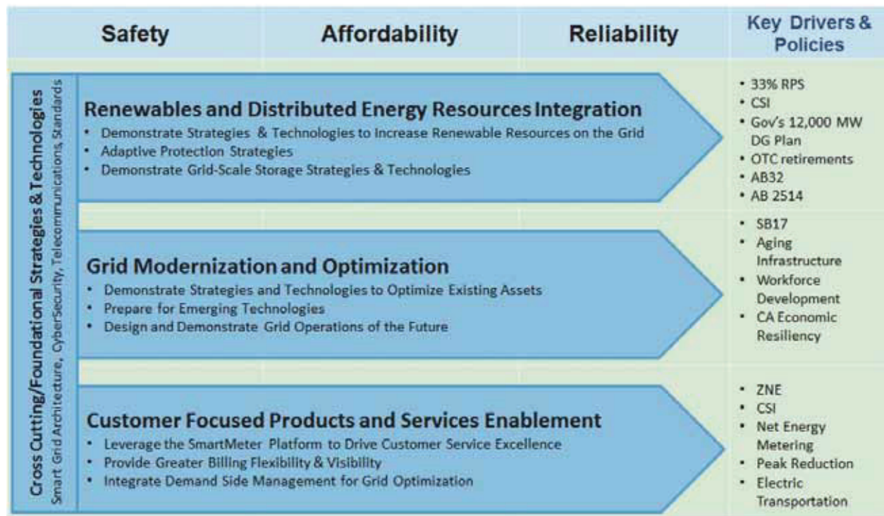
Figure 1. IOU Working Framework for EPIC Plans

These four categories are described below in more detail. All four categories strive to provide electric IOU ratepayers the benefits of greater reliability, lower costs, and increased safety, while simultaneously providing benefits related to greenhouse gas emissions mitigation, the California Loading Order, low-emission vehicles/transportation issues, economic development, the efficient use of ratepayer monies, and other general societal benefits.