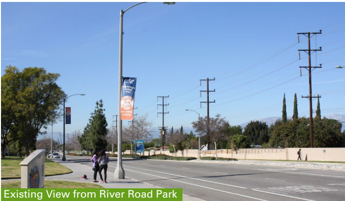
Existing View from River Road Park