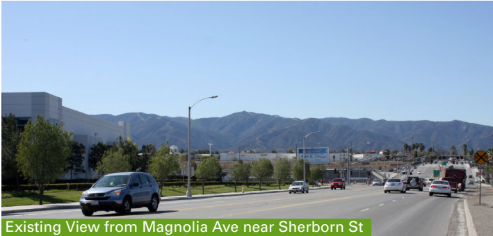
Existing View from Magnolia Ave near Sherborn St