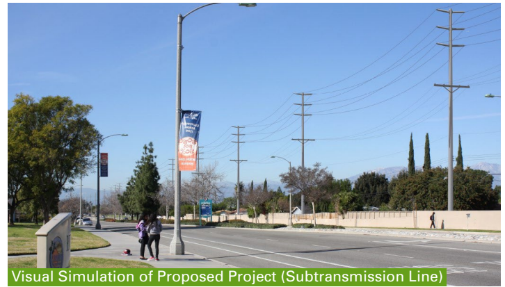
Visual Simulation of Proposed Project (Subtransmission Line)

Additional visual simulations are available on our project website