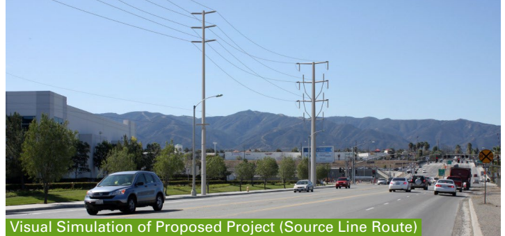
Visual Simulation of Proposed Project (Source Line Route)