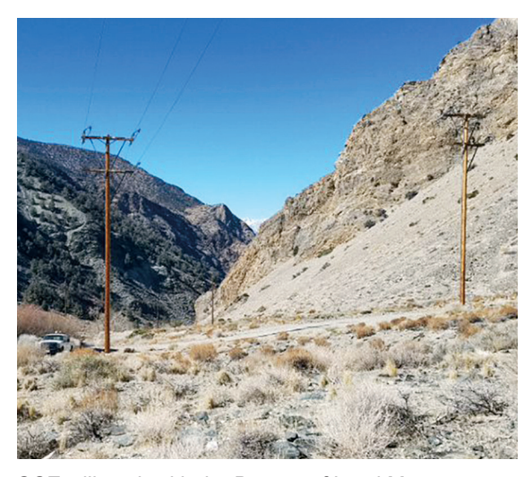
SCE will work with the Bureau of Land Management and Inyo National Forest to protect environmental and recreational opportunities.