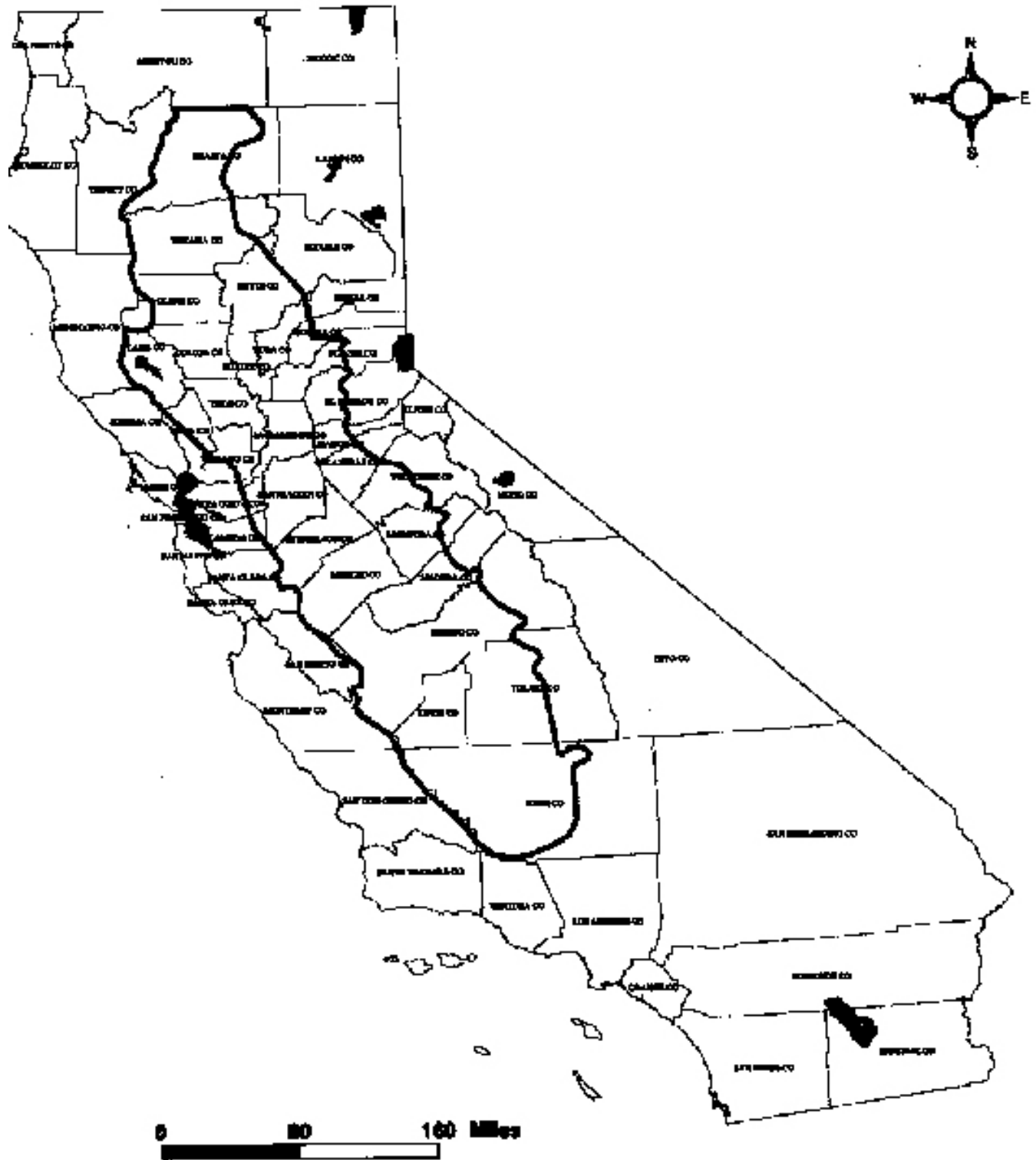
Figure 1: Ranges of the Valley Elderberry Longhorn Beetle