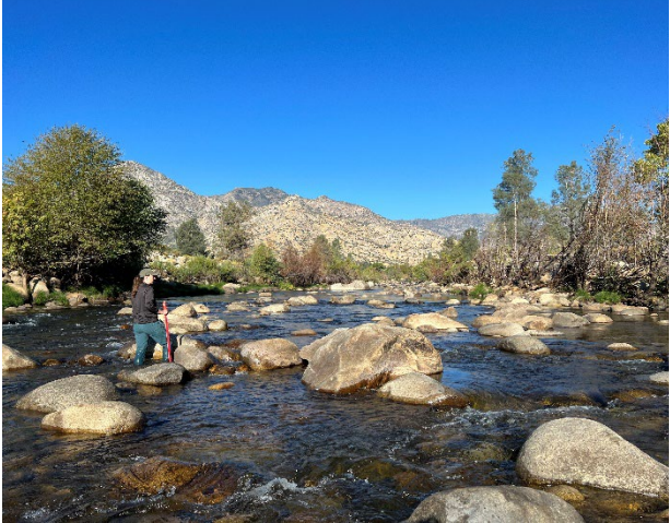
Facing upstream from Transect A