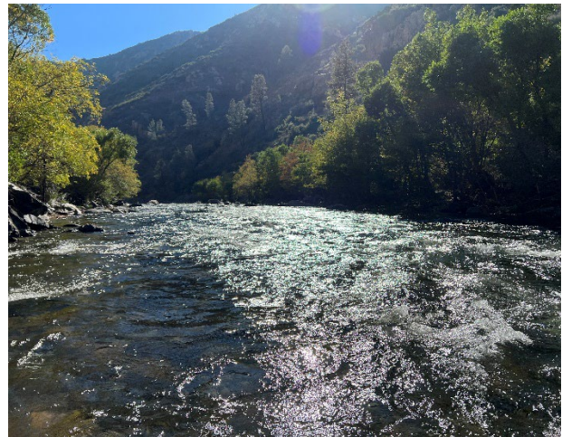
Facing downstream from Transect K