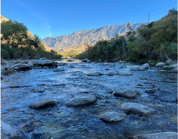
Facing upstream from Transect A