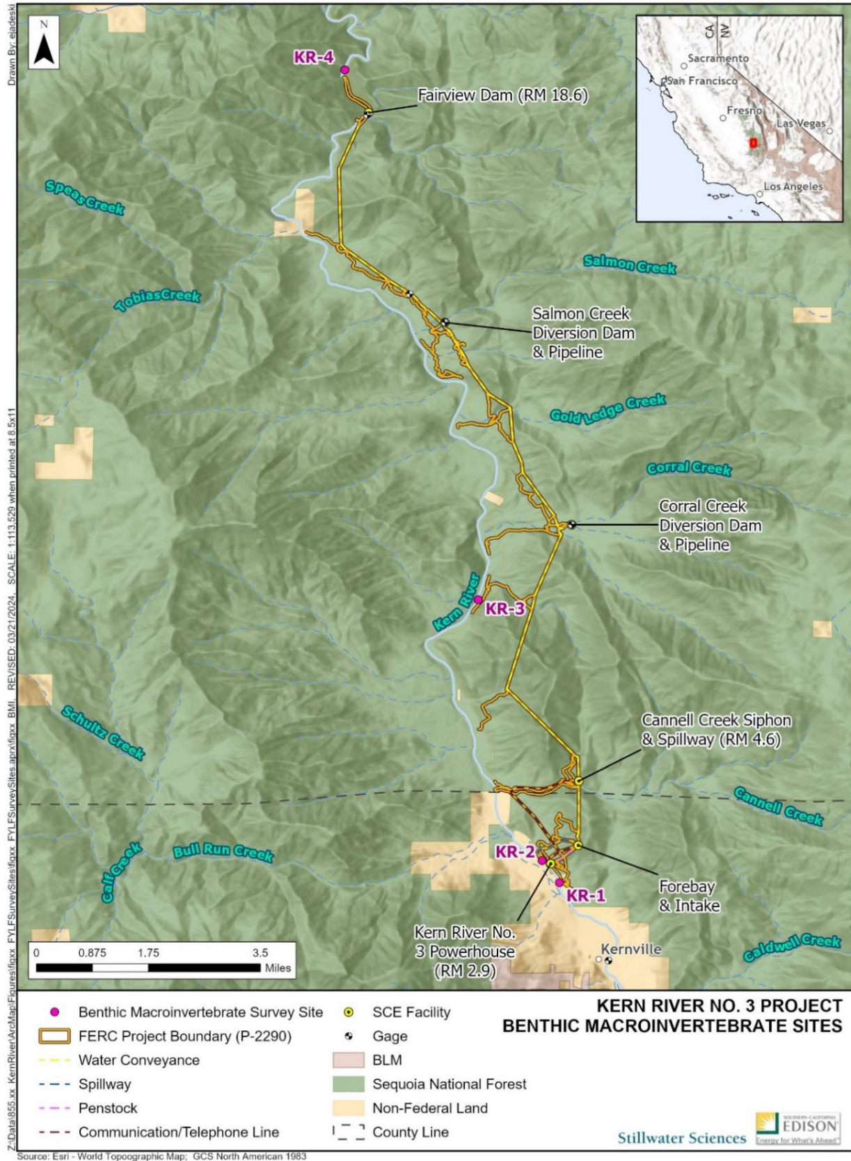
Figure 3-1. Benthic Macroinvertebrate Study Area.