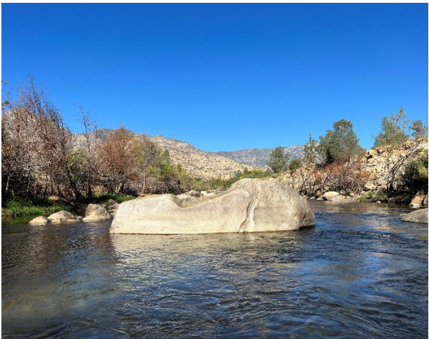
Facing upstream from Transect F