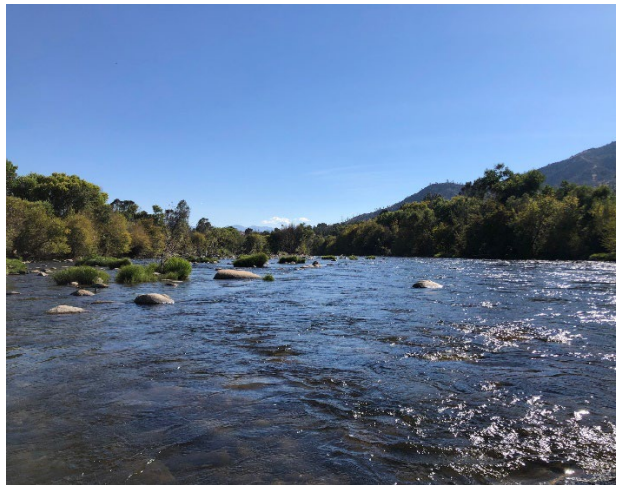
Facing downstream from Transect K