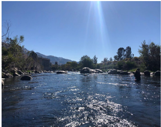
Facing downstream from Transect K