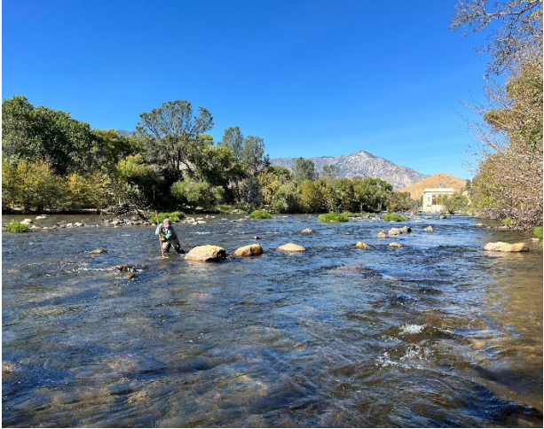
Facing upstream from Transect A