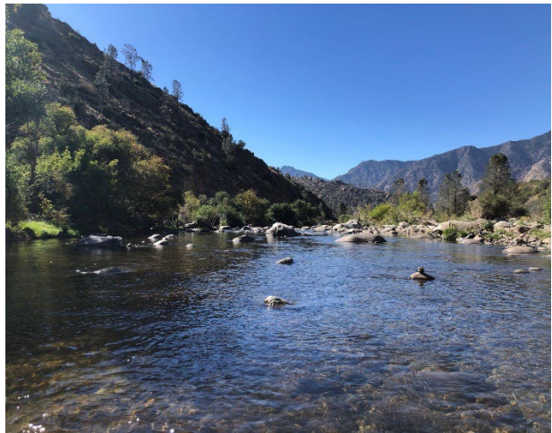
Facing downstream from Transect K