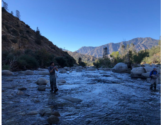
Facing downstream from Transect F