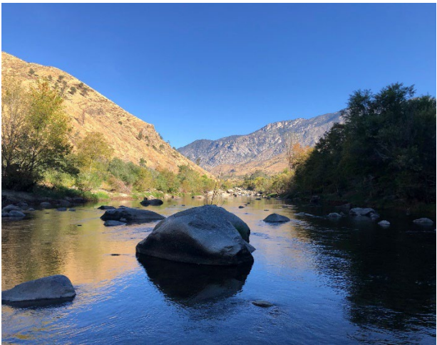
Facing upstream from Transect F