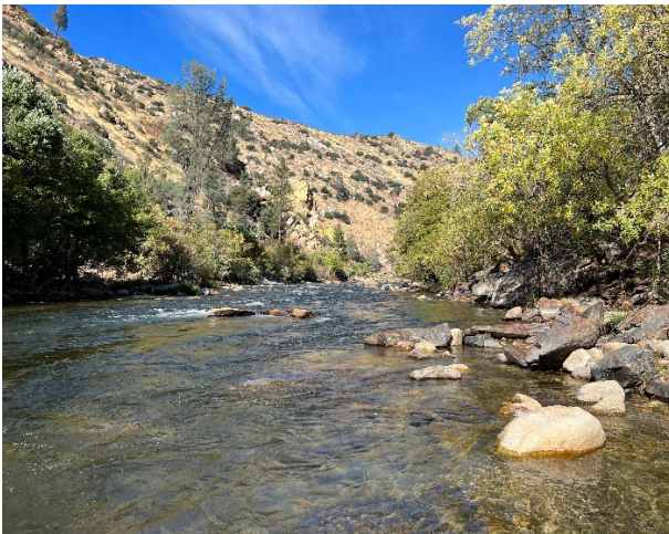
Facing upstream from Transect F