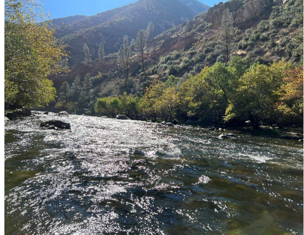
Facing downstream from Transect F