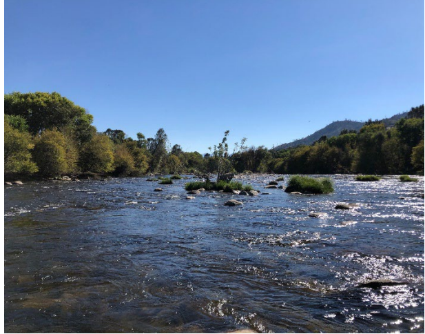
Facing downstream from Transect F