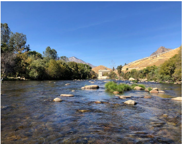
Facing upstream from Transect F