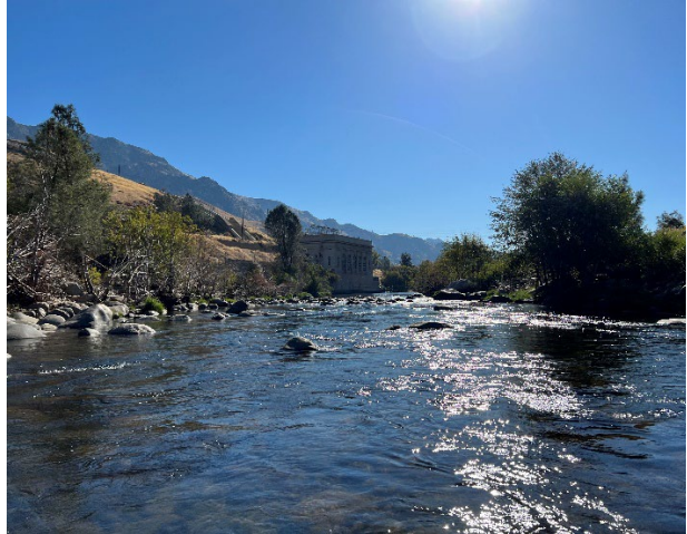
Facing downstream from Transect F