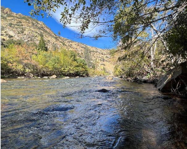
Facing upstream from Transect A